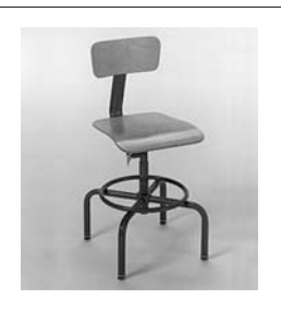
Plywood Seat and Back, Threaded Post Mechanism (ATPBM)