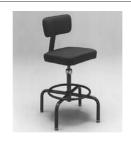
Upholstered Seat and Back, Threaded Post Mechanism (ATUBM)