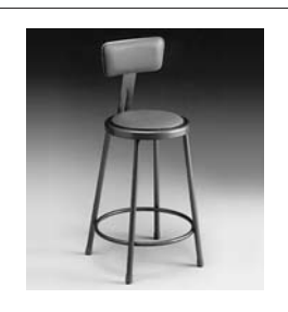
Upholstered Seat/Back Stool (630BU)