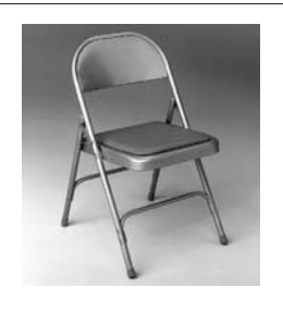
300 Series Upholstered Seat (303)