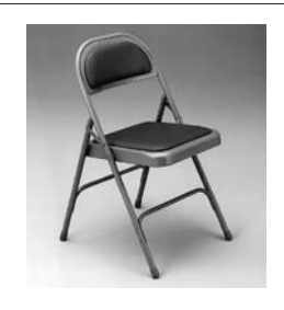
300 Upholstered Seat and Back (304)